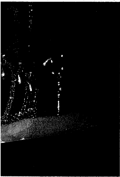
a Day as the Scott County Grandmother